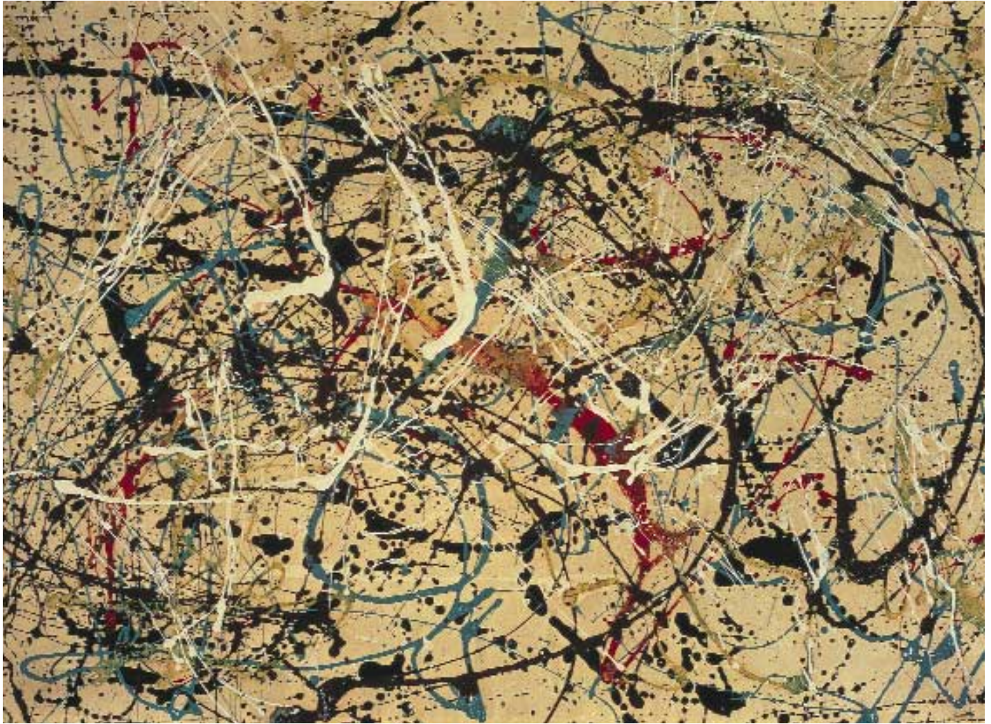
NUMBER 20, 1949 (ENAMEL ON PAPER LAID DOWN ON MASONITE BY JACKSON POLLACK (1912-56) PRIVATE COLLECTION/JAMES GOODMAN GALLERY, NEW YORK, USA/BRIDGEMAN ART LIBRARY